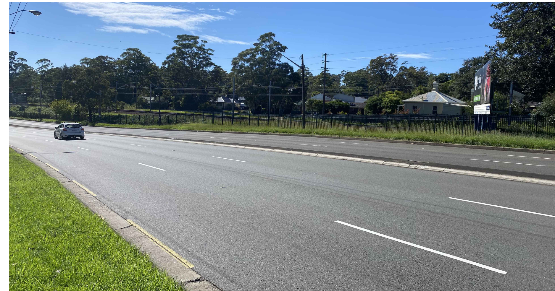
A photograph showing a roadside area with a grassy verge in the foreground, a black metal fence running along it, and a road with several vehicles (including a white van and a truck) in the background under a clear blue sky.